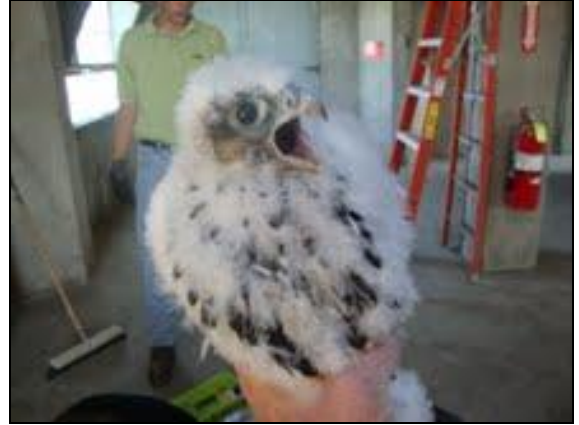
This young falcon is around 26 days old.

Female: 1687-30500 50/S b/r Sodie Male: 1126-14174 98/C b/r Roger Male: 1126-14173 97/C b/r Bobbie Male: 1126-14172 96/C b/r Adam F