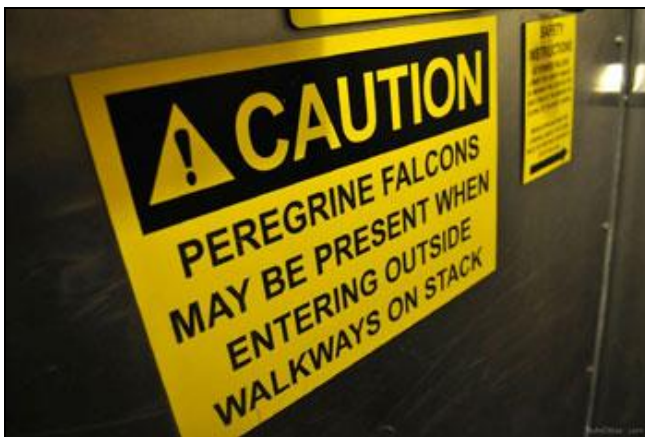
A sign in the stack elevator.