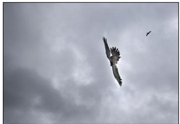
Belinda in a stoop.