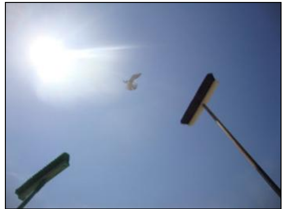
Lolo flies up into the sun and stoops, making it very hard to track her in a dive.

To get the young falcons at this site, we remove a panel from the back of the nestbox. We got three of them easily, but the fourth moved to the front and hopped up onto the box's lip – a dangerous place for a young baby that can't fly yet. We backed away and Bob got a broom from one of the guys to wave in front of the box. The baby jumped back in the nestbox, and we got it. That was too close for comfort, although I wouldn't necessarily have expected a 26-day old baby to get that close to the drop. We are going to replace this nestbox with one that closes the front when the top is opened.