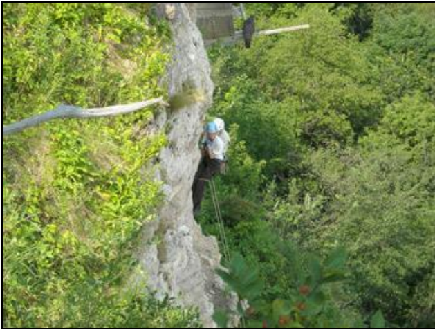
Rhoni and Bob on rope

Year falcons first nested here: 2001 | Total young fledged from this location (2010): 23